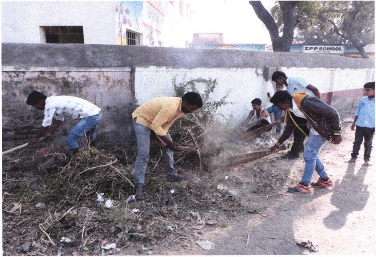
Plastic free campaign programme