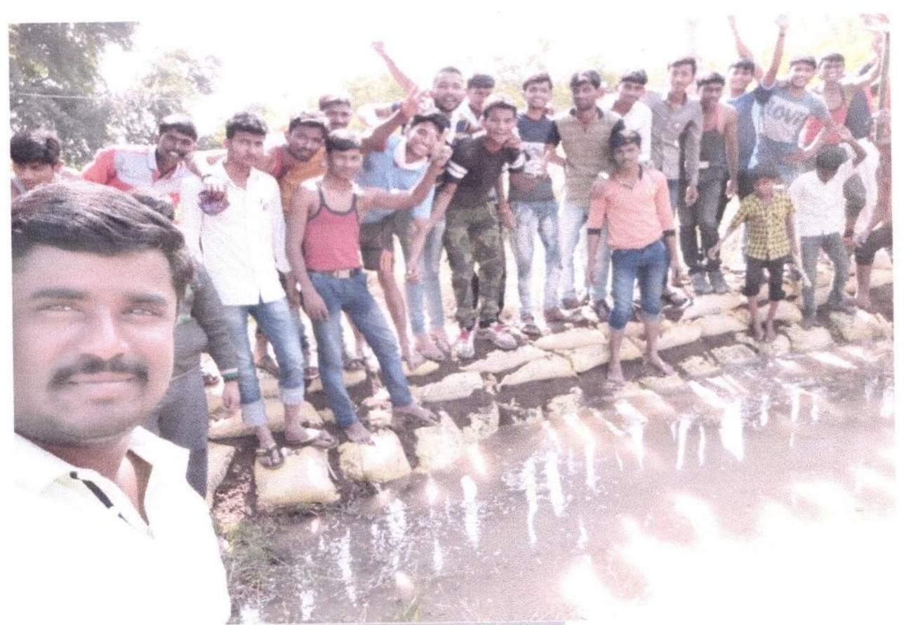
Construction of Vanraibandhara