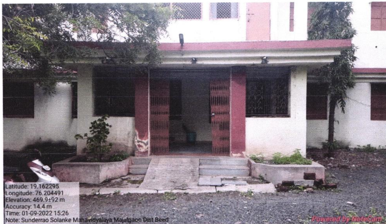
Library Ramp for Divyang Student