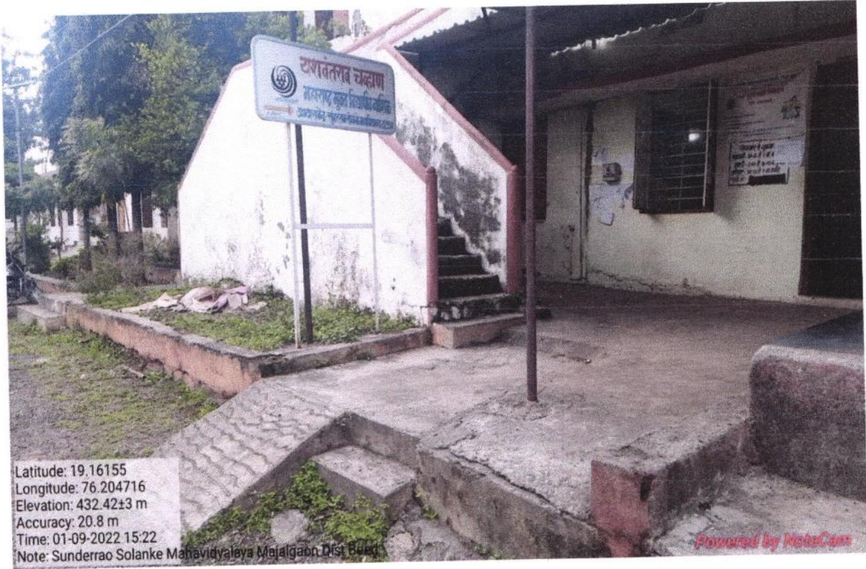
Ramp for Divyang Student