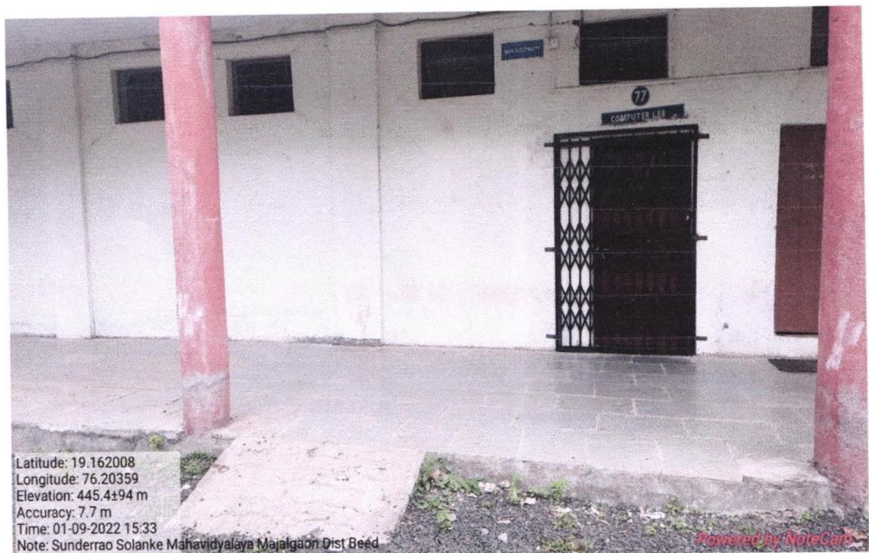
Student Lab Ramp