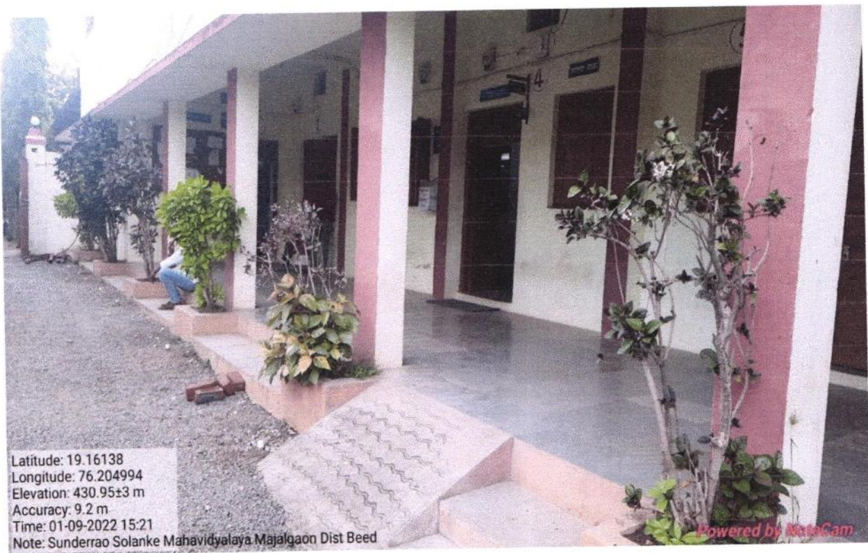
Administrative Building Ramp