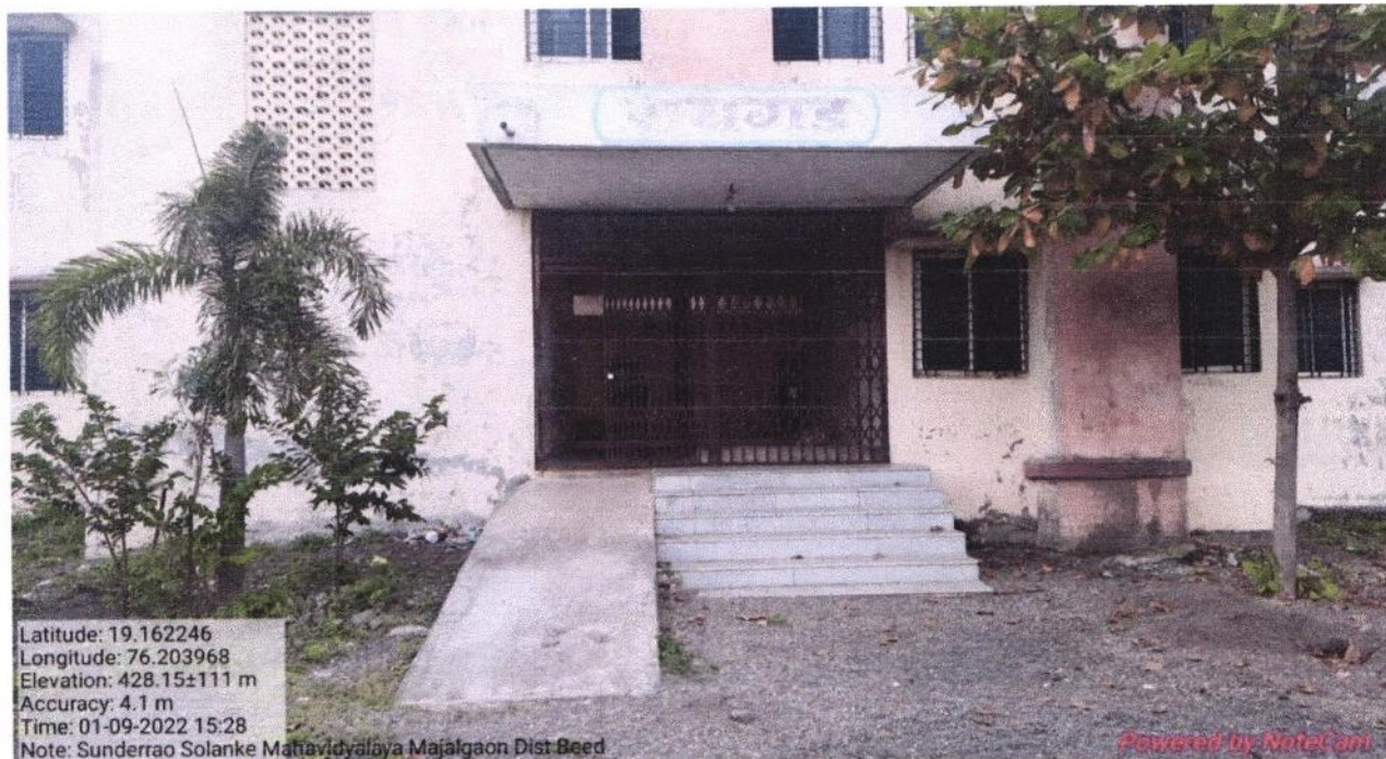
Ladies Hostel Ramp