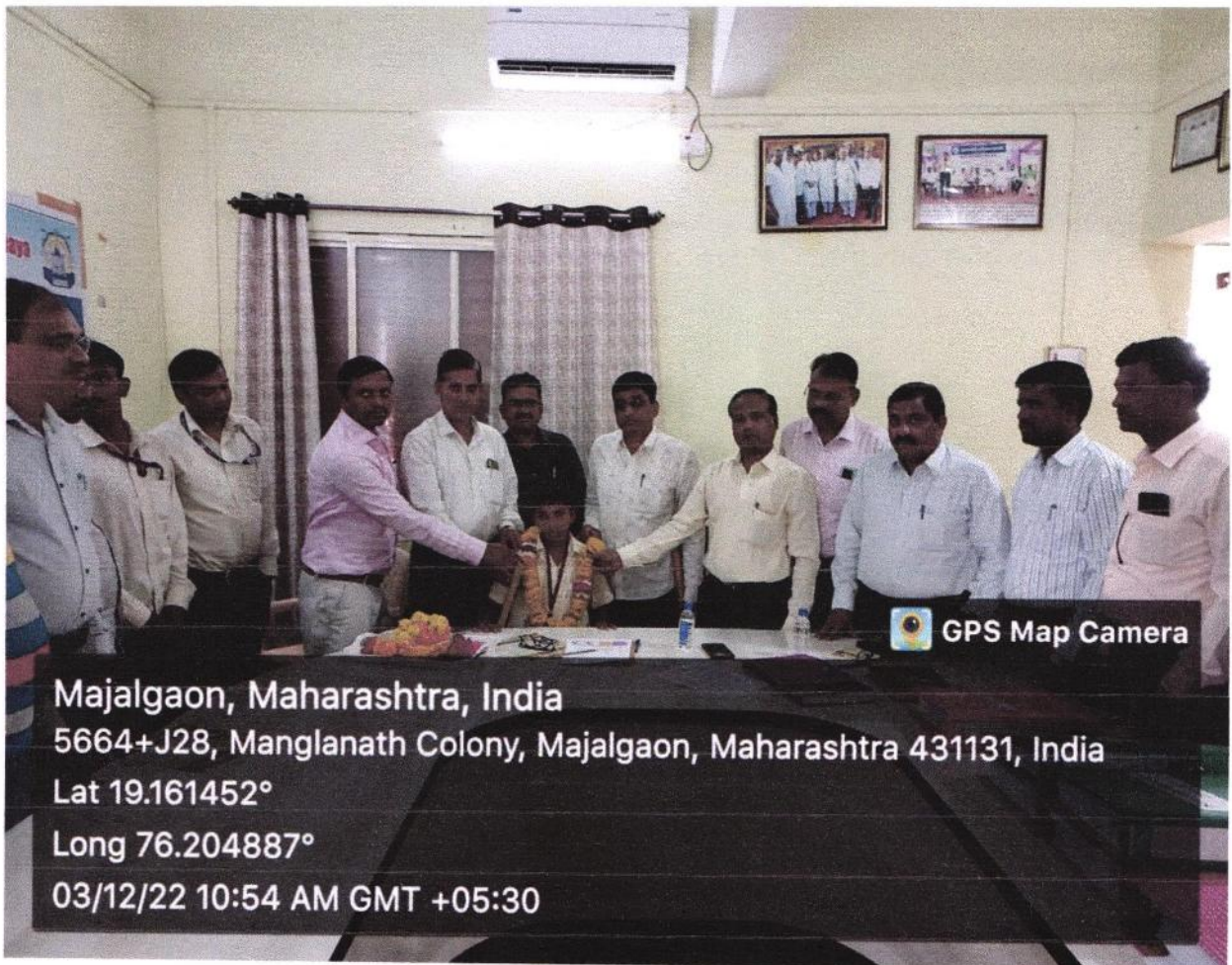
Celebration of Divyang Day