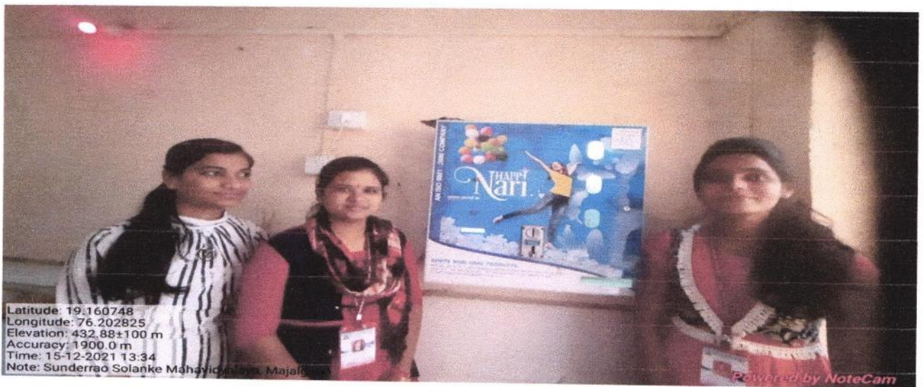
Sanitary Napkin Machine in Common Room