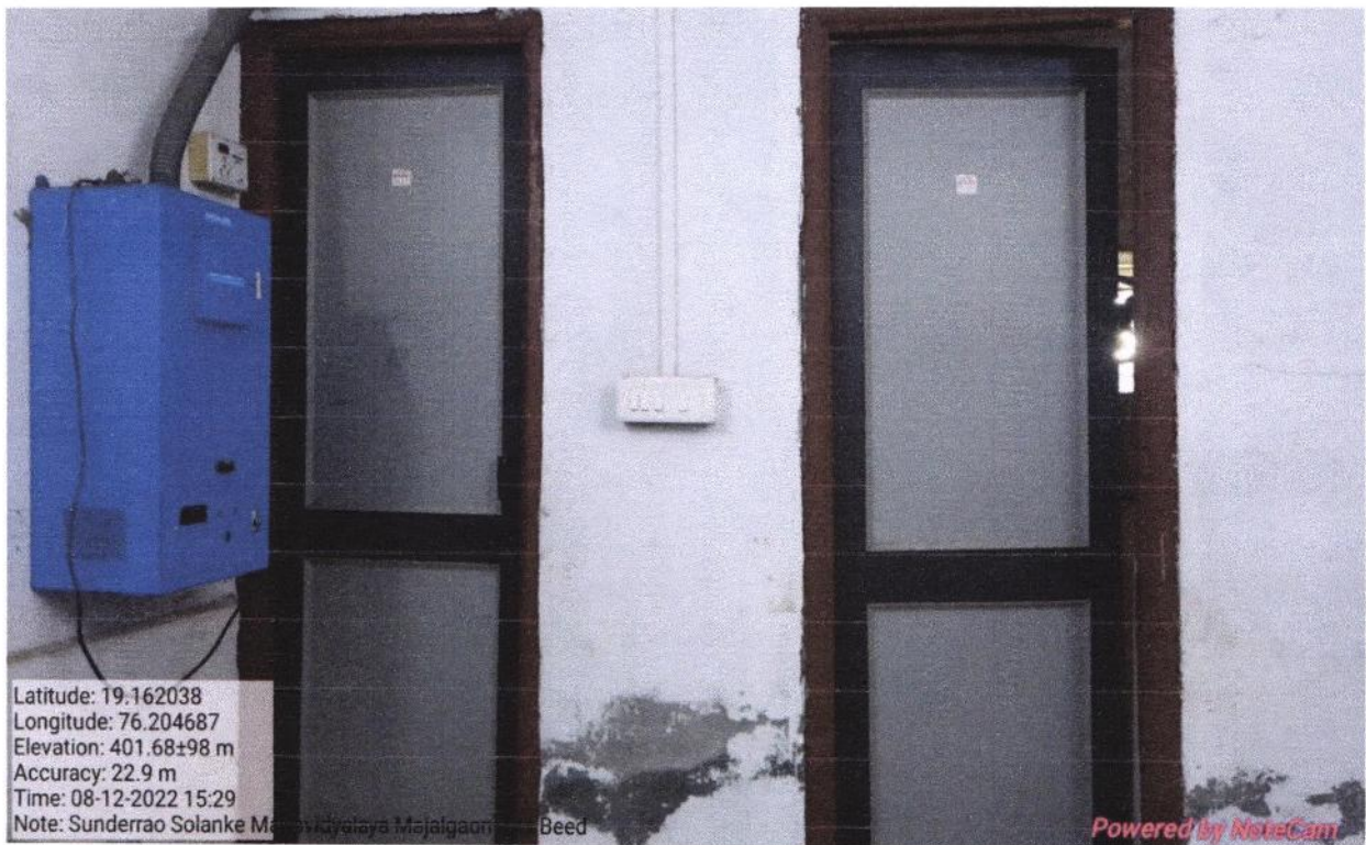
Ladies Common Room Wash Room