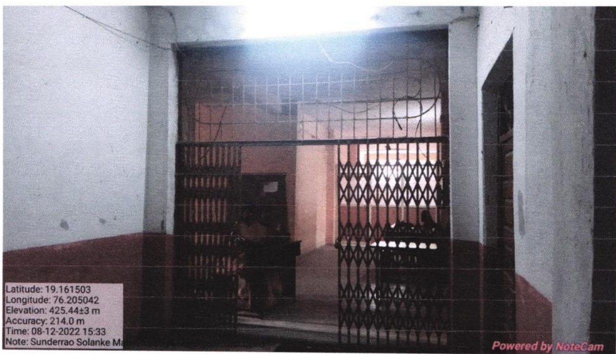
Ladies Suggestion & Complaint Box

Latitude: 19.161503 Longitude: 76.205042 Elevation: 425.44±3 m Accuracy: 214.0 m Time: 08-12-2022 15:33 Note: Sunderrao Solanke M