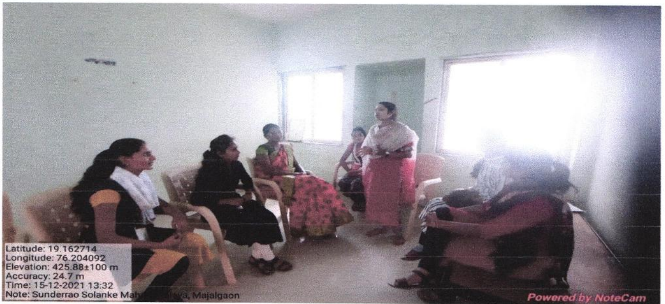
Common Room for Girls

In terms of Common Room, the college has reserved separate waiting cum recreation room and rest room for the girl students with attached washroom.