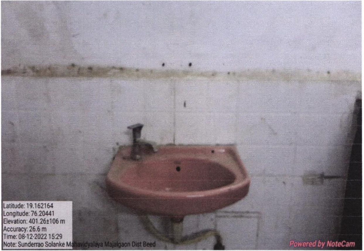
Ladies Common Room Wash Basin