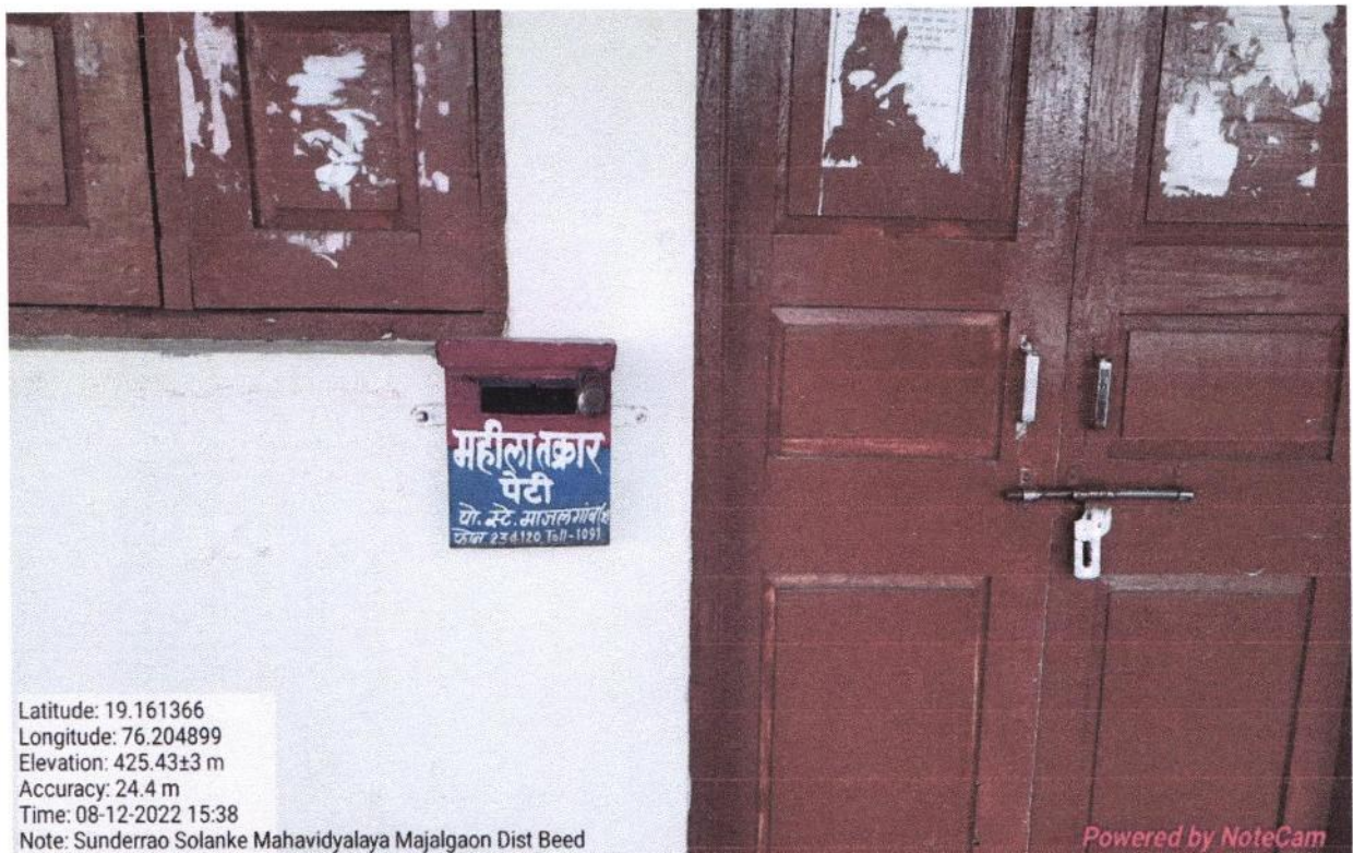
Ladies Suggestion & Complaint Box at Administrative Building