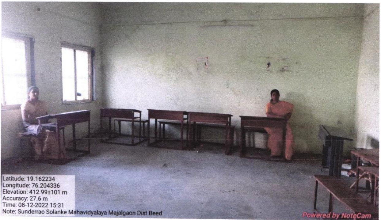
Ladies Security Staff at Common Room