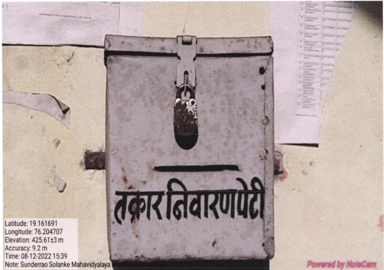
Ladies Suggestion & Complaint Box at Science Wing