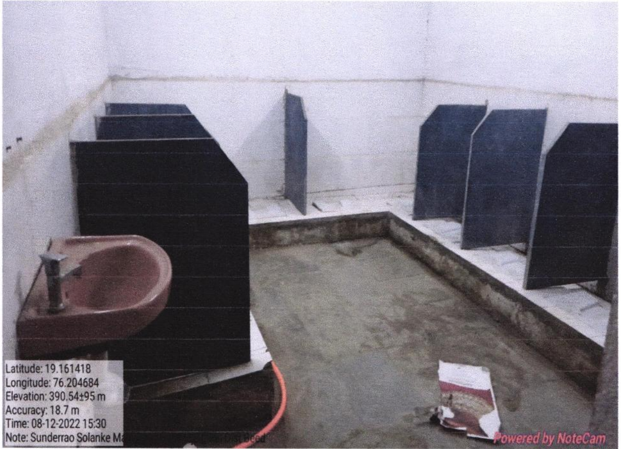
Ladies Common Room Wash Room