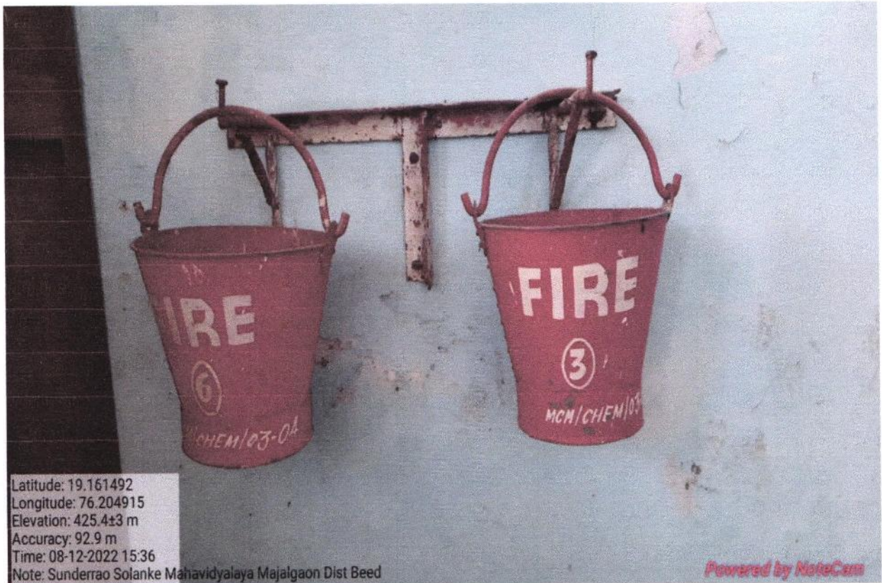
Fire Safety Bucket