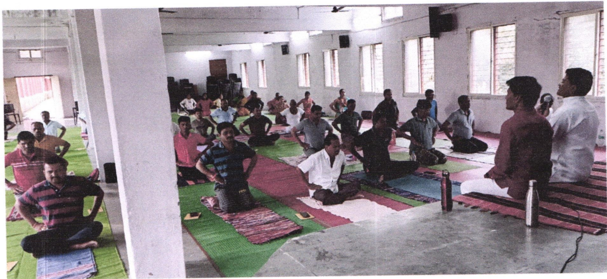
College level yoga camp