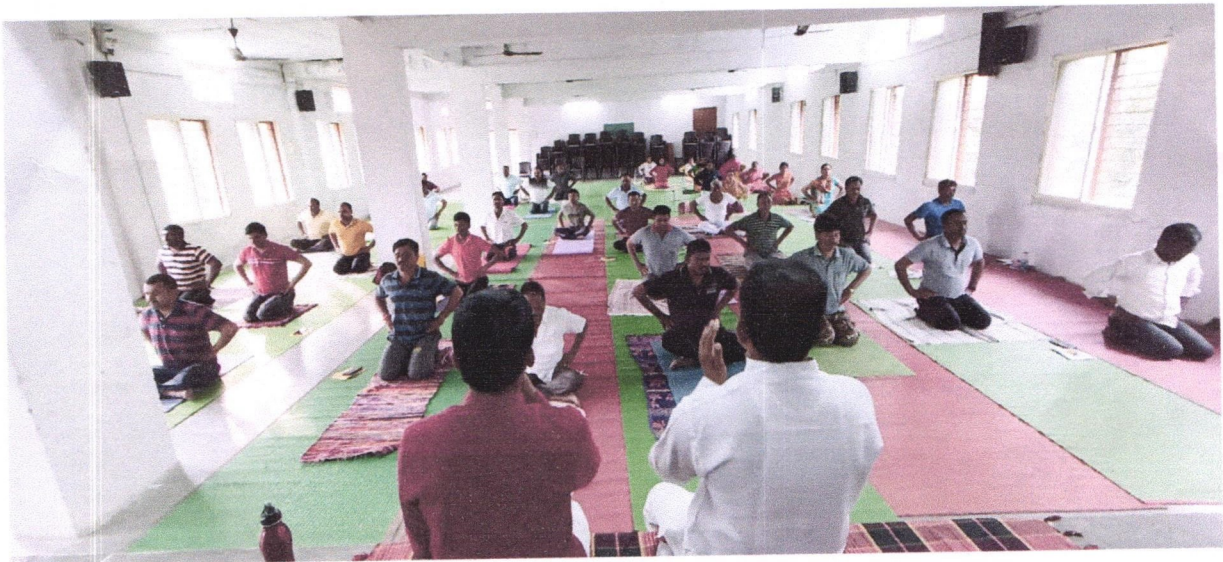
College level yoga camp