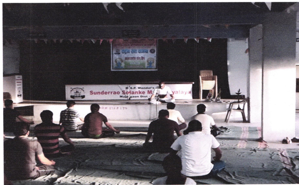
Celebration of International Yoga Day