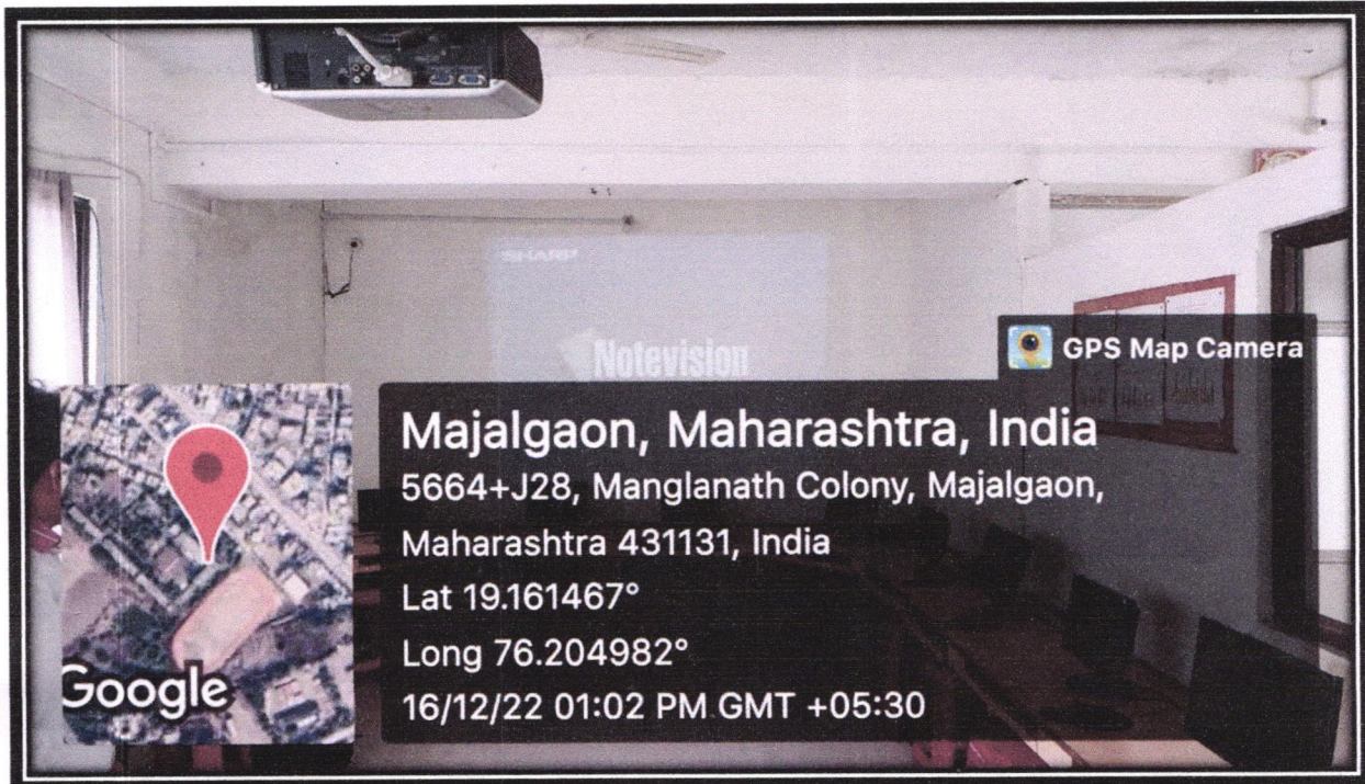
ICT Enabled Classroom, Department of Computer Science (Hall No. Lab.)