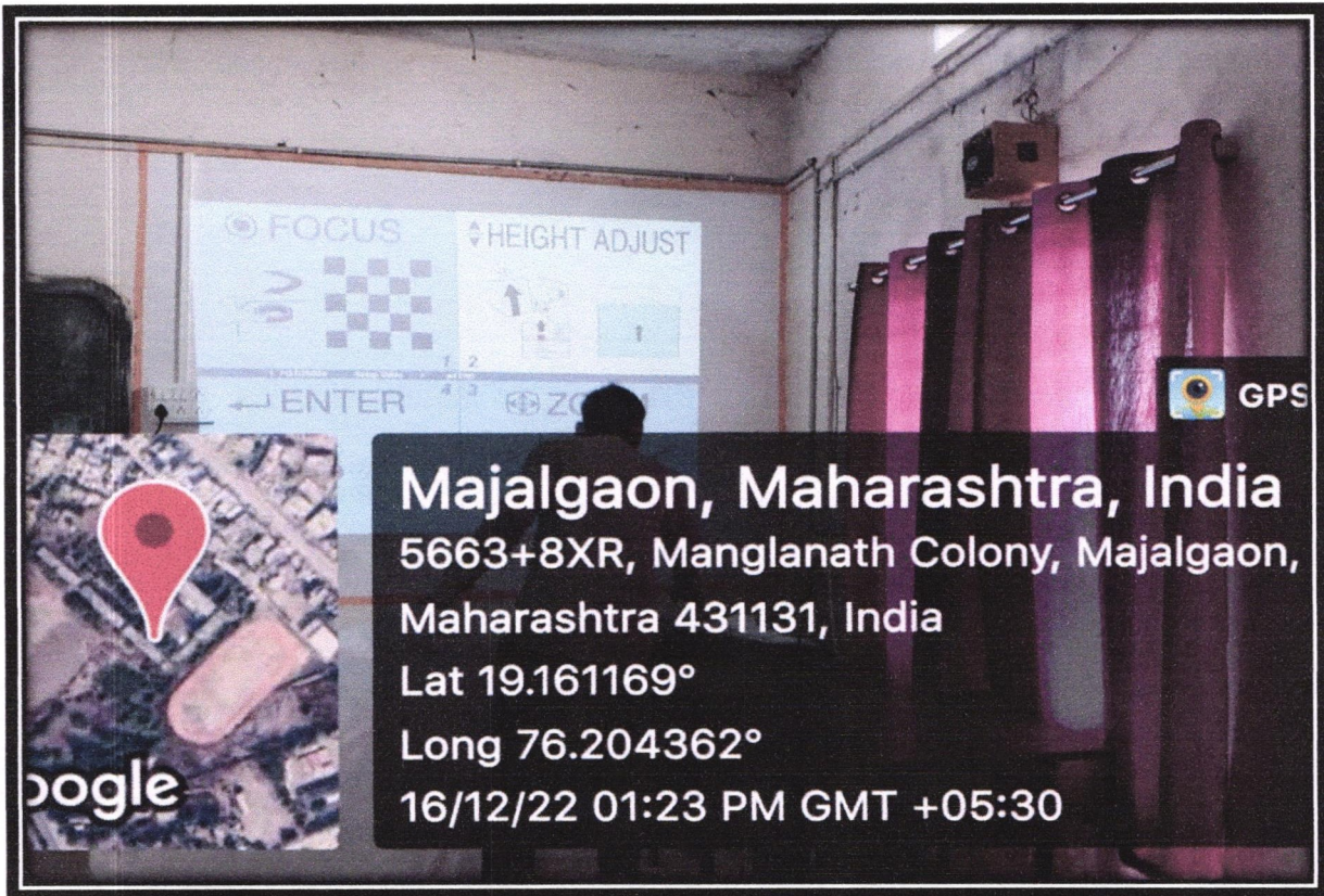
ICT Enabled Classroom, Hall No. (36)