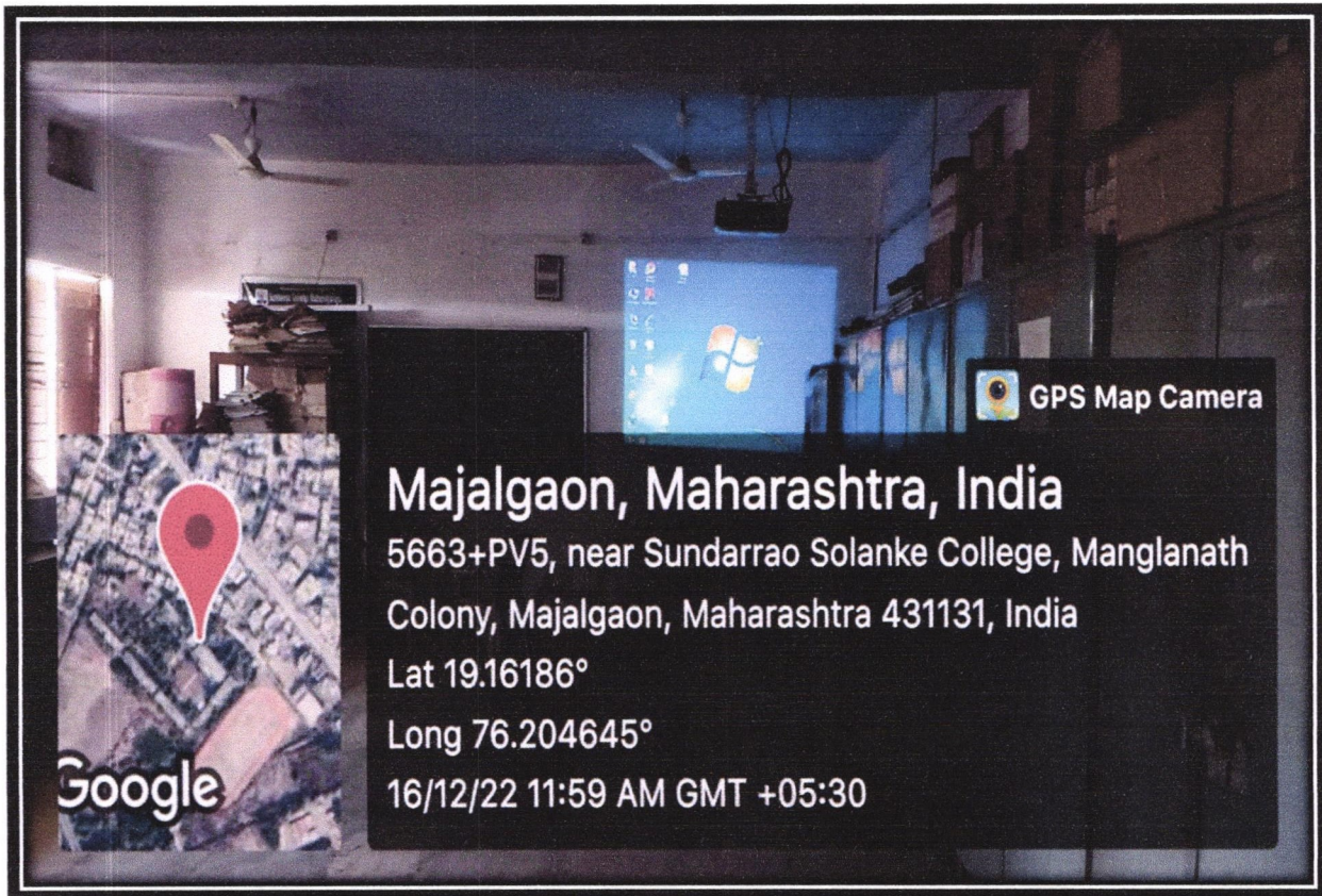
ICT Enabled Classroom, Department of Botany (70)