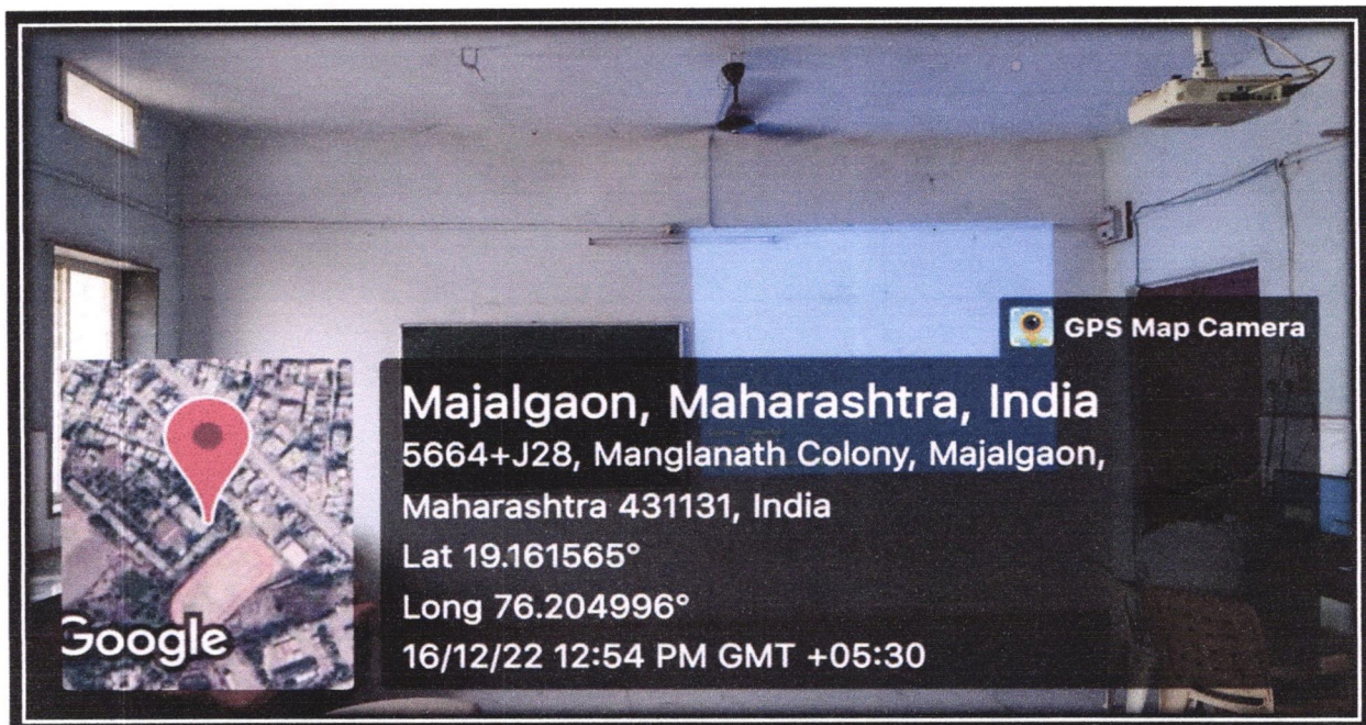
ICT Enabled Classroom, Department of Chemistry (Hall No. 48)